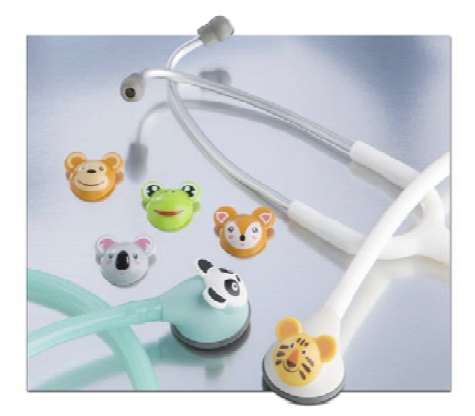
ADSCOPE<sup>TM</sup> 617 / 618 Stethoscopes