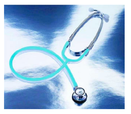
PROSCOPE<sup>™</sup> 675 Institutional Pediatric Scope