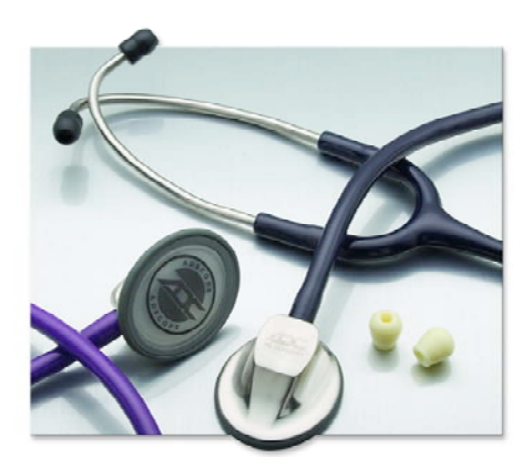
ADSCOPE<sup>™</sup> 615 Platinum Professional Edition

ultiple patients the risk of incidental rubbing mance and wearer comfort