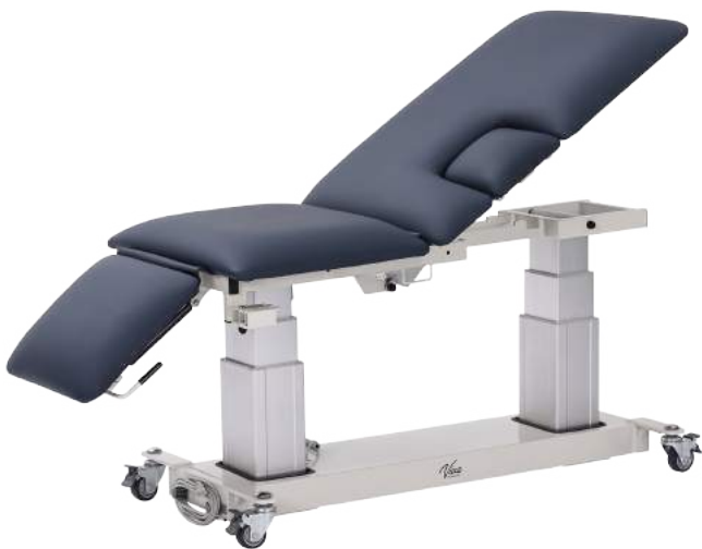
Multi-Use Imaging Power Table with 3-Section Top & Drop Window

Level up your imaging equipment with our Viva Comfort Multi-Use Imaging Power Table with a Three-Section Top & Drop Window – your premier solution for versatile and comfortable imaging procedures. The three-section top design includes a pneumatic adjustable backrest, manual footrest, and a convenient drop window, providing optimal patient positioning for various procedures. To give you a premium imaging table that truly is unmatched, we covered the outfitted 3" padding with antimicrobial upholstery. With an included easy-to-use hand control, the table's height adjustments are effortlessly accessible. The imaging table's design enables a swift and smooth transition in just 16 seconds for height adjustments without load and 27 seconds with a remarkable weight capacity of 550 lbs. The table's adaptable features extend to its Trendelenburg and Reverse Trendelenburg angles, as well as the leg section and backrest adjustments, guaranteeing patient comfort during various medical procedures.