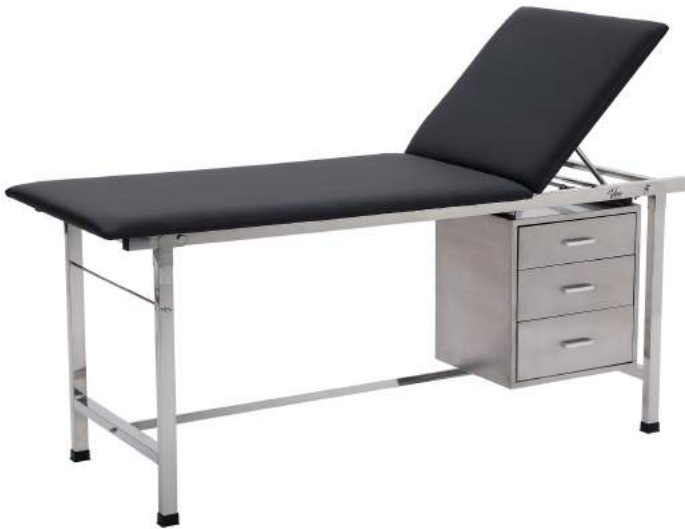
Adjustable Exam Table with Drawers and Paper Dispenser, Black

Upgrade your medical examination experience with our unique Viva Comfort Adjustable Exam Tables. These exceptional medical exam tables redefine convenience and functionality, boasting a unique combination of features that set them apart from all others. To create a safe and hygienic environment, each table is equipped with a built-in paper roll dispenser and paper cutter, allowing for quick liner changing between patients. Additionally, it is outfitted with a 2" thick foam padding to provide superior patient comfort and antimicrobial upholstery, helping guarantee a sterile environment for your patients.