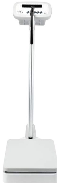
Digital Physician Scale With Height Rod