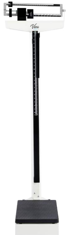
Physician Beam Scale With Height Rod