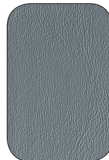
Blue Fog (-32)