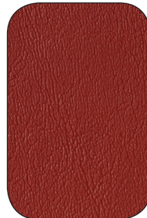
Tapestry Red (-26)