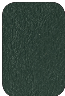
Deep Sea (-29)