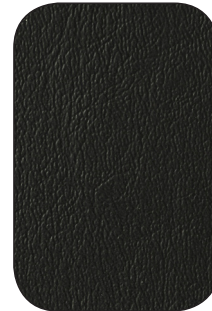
Black Satin (-24)