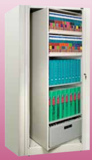
Revolving With just an easy spin, another complete set of files is accessible.