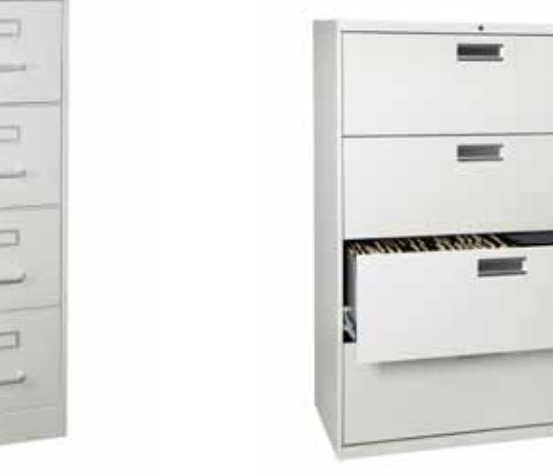
Vertical 4 Drawer Lateral 4 Drawer