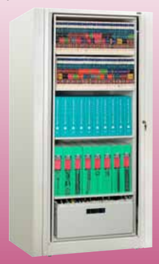
Open When open, the Ez2® provides quick and easy access.