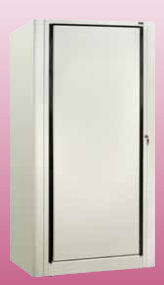
Closed When closed, the Ez2® locks for total security, helping to meet HIPAA regulations