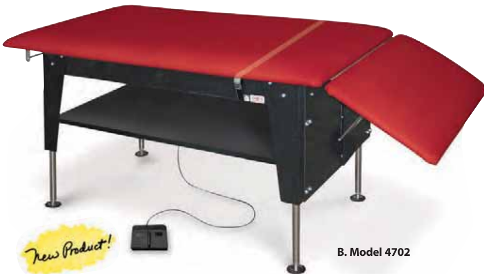
B. Model 4702