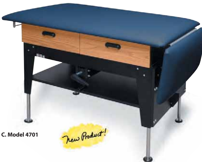
C. Model 4701