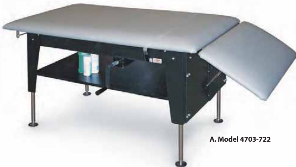
A. Model 4703-722