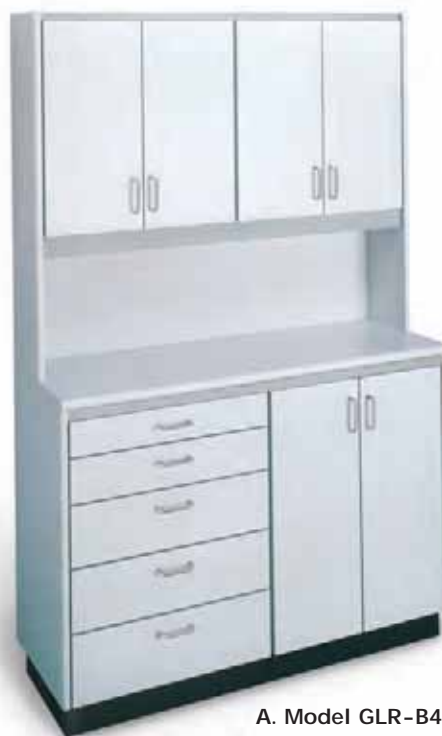
A. Model GLR-B4