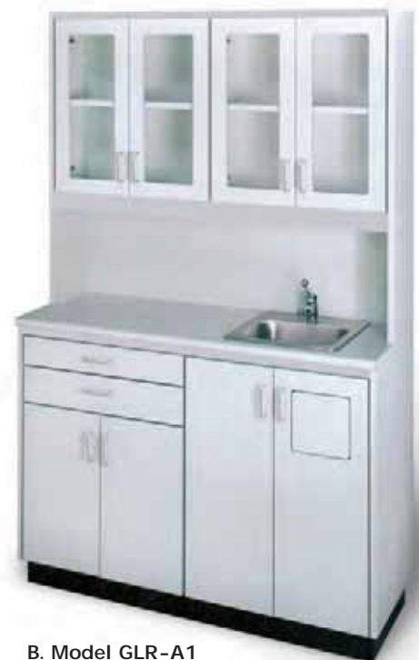
B. Model GLR-A1