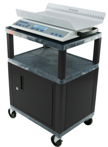
2210CART Optional Rolling Cart

To learn more, call 1-800-815-6615 or visit homscales.com/2210KL-AM