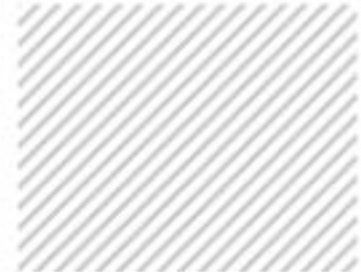
3. Unfold laterally, then toward head, and then toward feet.