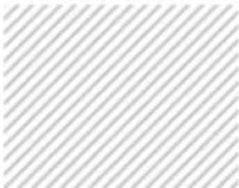
4. Firmly seal fenestration to patient's skin to complete draping.