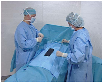
4. Unfold drape toward feet and firmly seal edge of fenestration to patient's skin. Insert surgical lines and tubing through the tube holders.