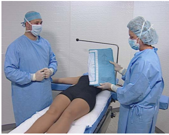
1. Orient body stamp on drape with patient and remove adhesive strip liners clockwise.