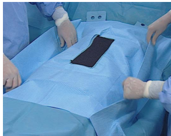
5. Open troughs to help contain excess fluids to complete draping.