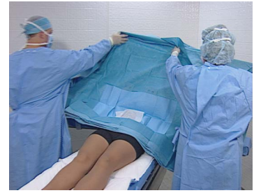
3. Unfold drape, first laterally, then toward head to form an anesthesia screen and extend armboard covers laterally.