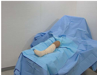
5. Insert surgical lines and tubing through the tube holders to complete draping.