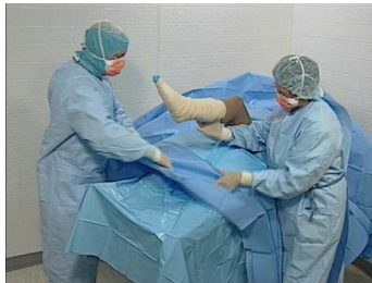
4. Unfold toward feet.