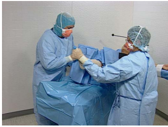
2. Unfold drape once and guide extremity through the conformable fenestration.