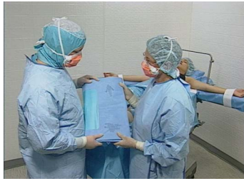
1. With an Impervious Split Drape and an Impervious Stockinette in place, orient body stamp on drape with patient.