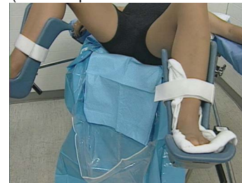
3. Draping is complete.