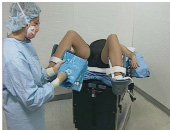
1. Orient Under Buttocks Drape with patient and insert right and left hands as marked.