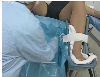
2. Slide drape under patient's buttocks.