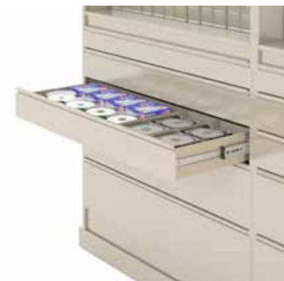
OPTIONAL ROLL OUT DRAWER