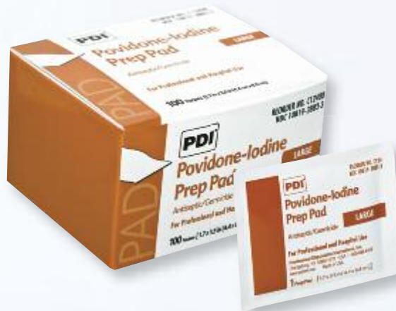
E. PVP IODINE PREP PAD – LARGE