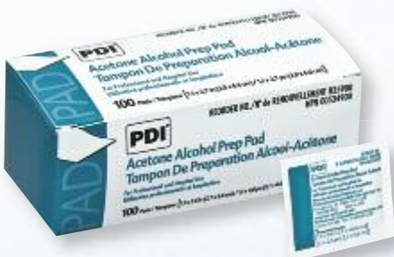
G. ACETONE ALCOHOL PREP PAD - MEDIUM