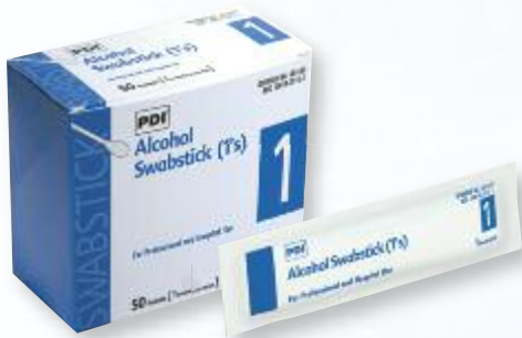
E. ALCOHOL SWABSTICK 1'S