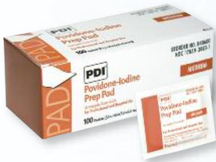
D. PVP IODINE PREP PAD – MEDIUM