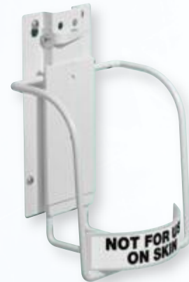
E. SANI-BRACKET® EXTRA LARGE (FOR BOXES)