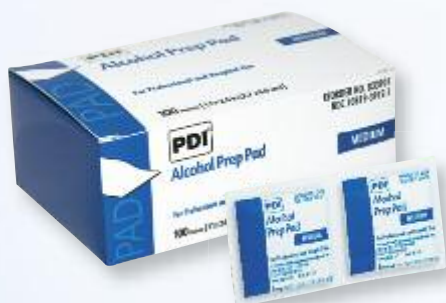
A. ALCOHOL PREP PAD – MEDIUM