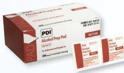
B. ALCOHOL PREP PAD – STERILE MEDIUM