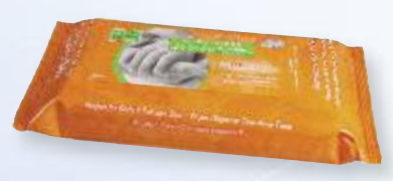
B. BABY WIPES (SCENTED) - FLEX PAK