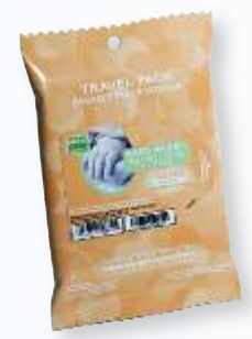
F. NEWBORN WASHCLOTHS (UNSCENTED) - SOLO® SOFTPAK