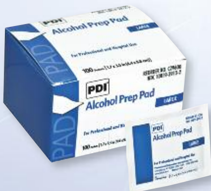
C. ALCOHOL PREP PAD – LARGE