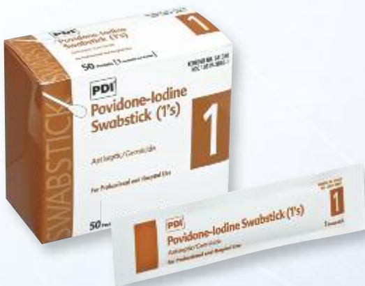
F. PVP IODINE PREP SWABSTICK 1'S