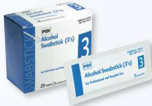
F. ALCOHOL SWABSTICK 3'S