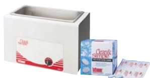
Clean & Simple™ Ultrasonic Cleaners and Tablets

Documents: date, time, temperature, pressure.