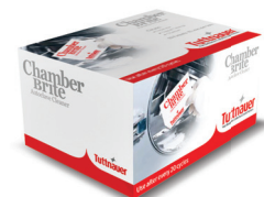
Chamber Brite Autoclave Cleaner