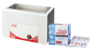
Clean&Simple™ Ultrasonic Cleaners and Tablets

Documents: date, time, temperature, pressure.