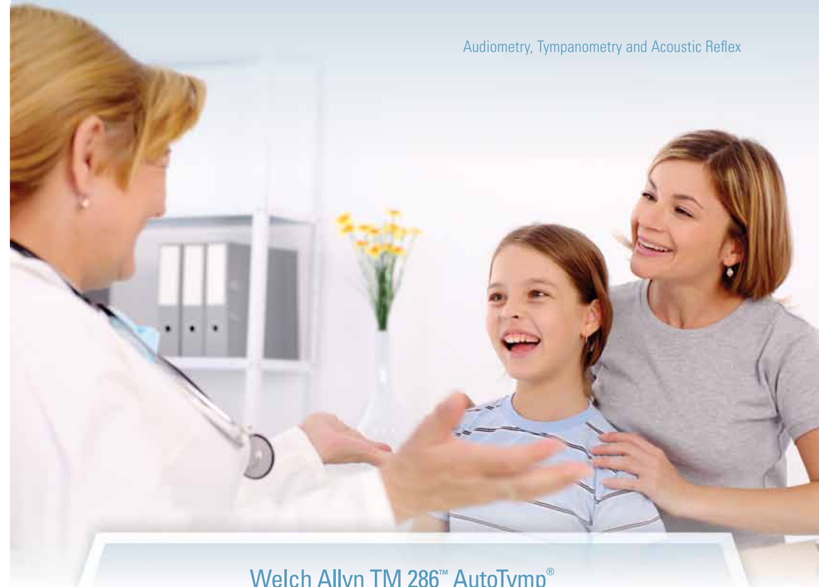
Audiometry, Tympanometry and Acoustic Reflex