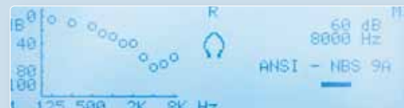
Sample Manual Audiogram result