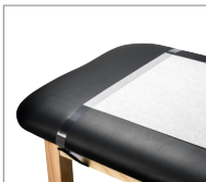
040– Paper Cutter