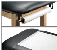
034– Paper Dispenser & Cutter Combo