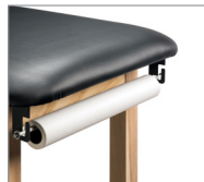
030– Paper Dispenser