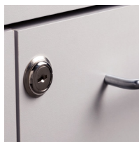
055 Door Locks