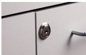
055 Door Locks