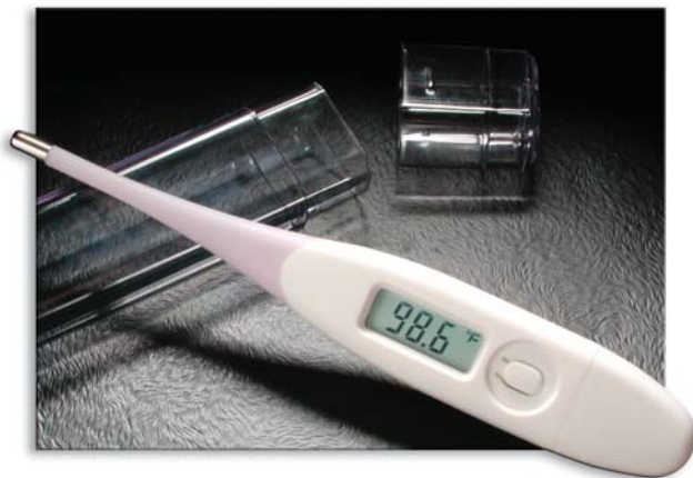
414 Adtemp™ III Series