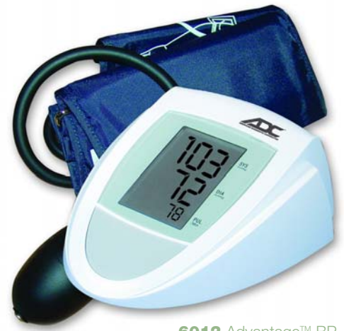
6012 Advantage™ BP