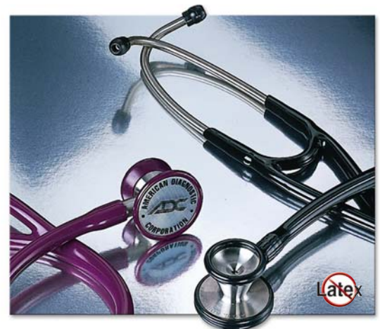
602 Adscope™ Series