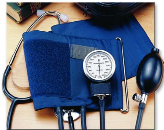
790 Prosplyg™ Series

Same as above, except diaphragm chestpiece attached to cuff for simplified use.