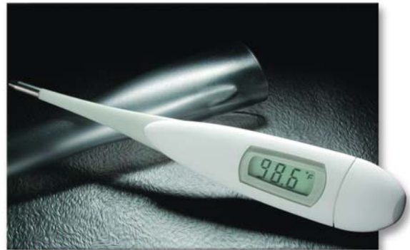
418 Adtemp™ V