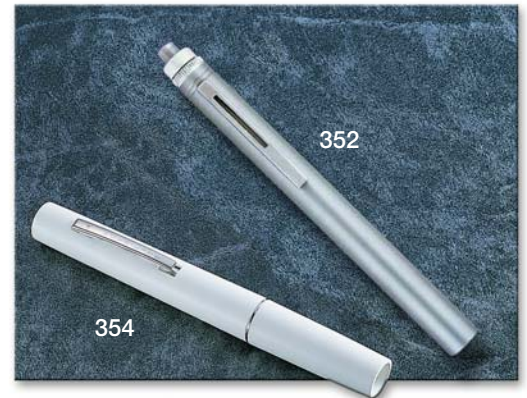
352 Metalite™ 354 Adlite™