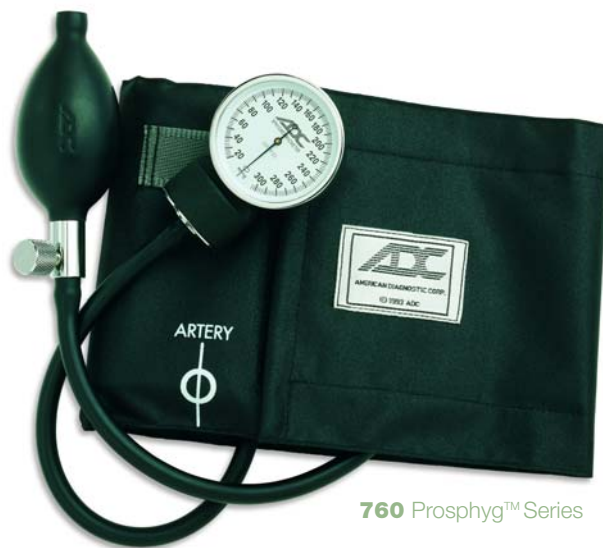
760 Prosplyg™ Series