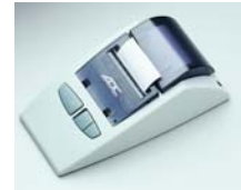
6014P - Optional Advantage™ Thermal Printer