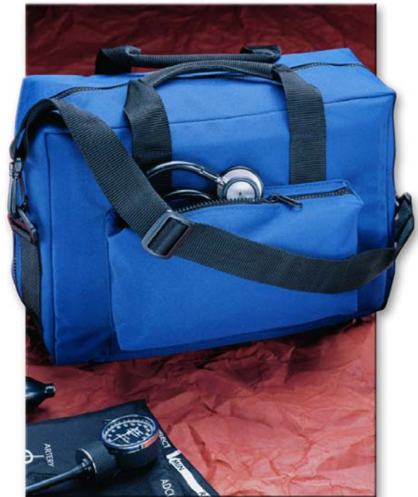
1024 Medical Bag

(Note: Items shown in caseware photo are not included)