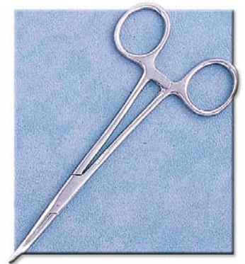
310 Kelly Forceps (Straight)