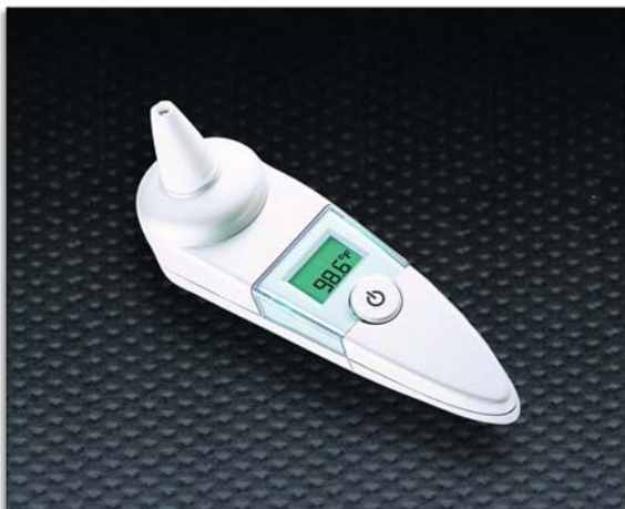
421 Adtemp™ Tympanic