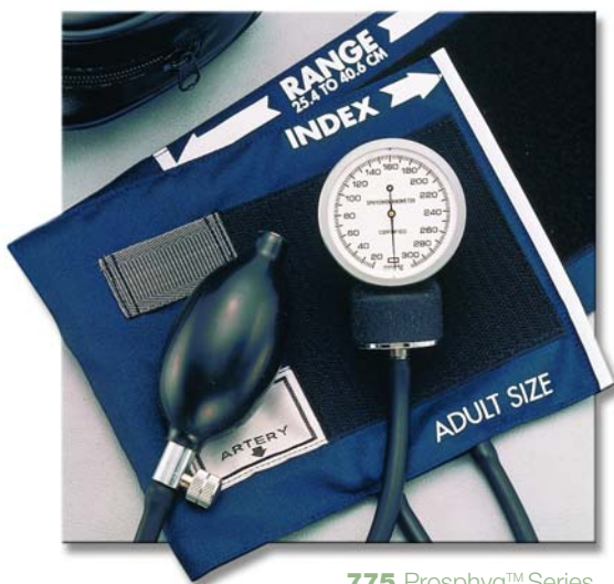
775 Prosplyg™ Series