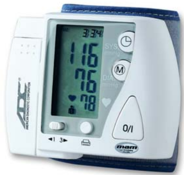
6016 Advantage™ BP