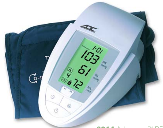
6014 Advantage™ BP