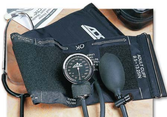
6005 Manual BP Kit