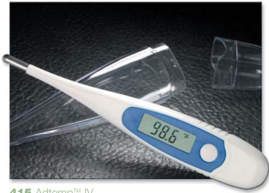
415 Adtemp™ IV