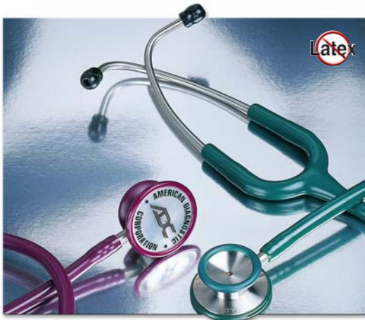
603 Adscope™ Series