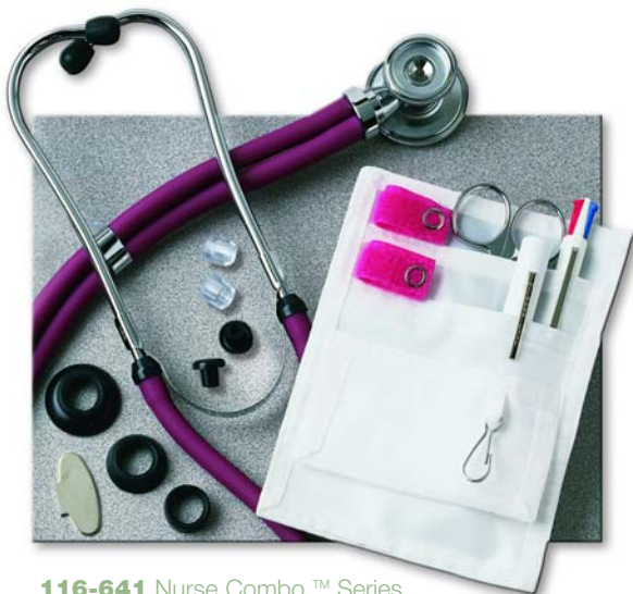
116-641 Nurse Combo™ Series