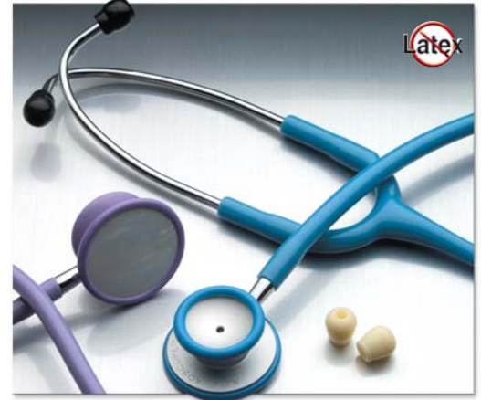
609 Adscope™ Series