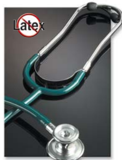
647 Sprague Series