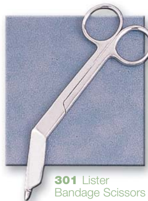
301 Lister Bandage Scissors