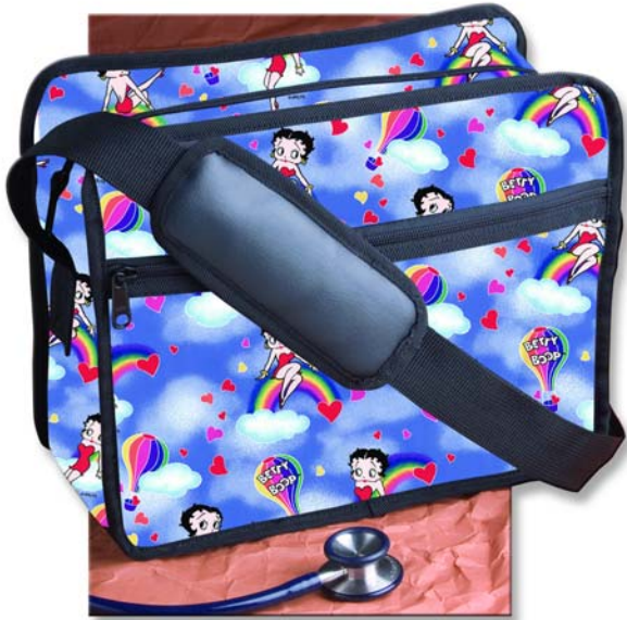
1026 Adtoon™ Nurse Carry Tote