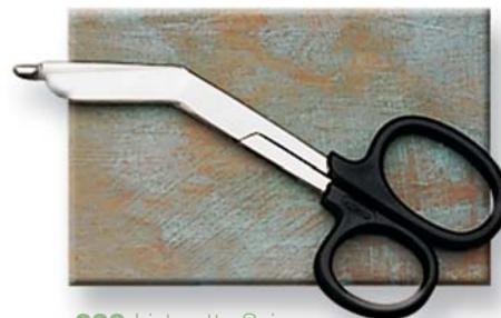
323 Listerette Scissors

Refer to full catalog for all model options