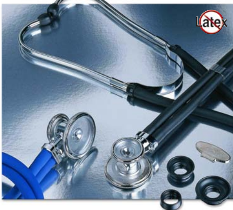
640 / 641 Sprague Series

Refer to full catalog for all model options