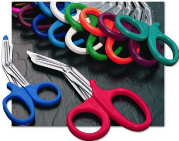
320 Medicut™ Series 321 Mini Medicut™ Series