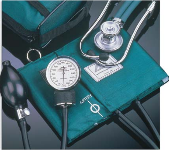
768-641 Pros Combo™ II Series