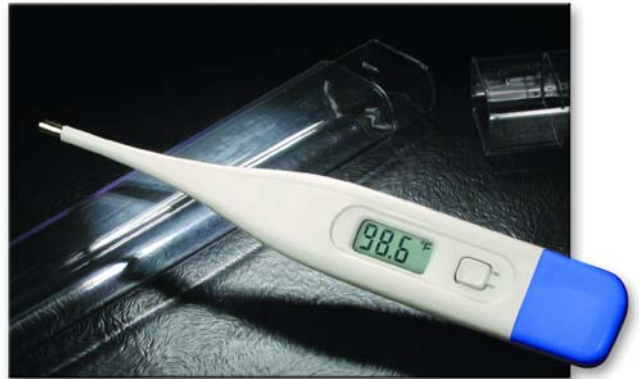
413 Adtemp™ II Series