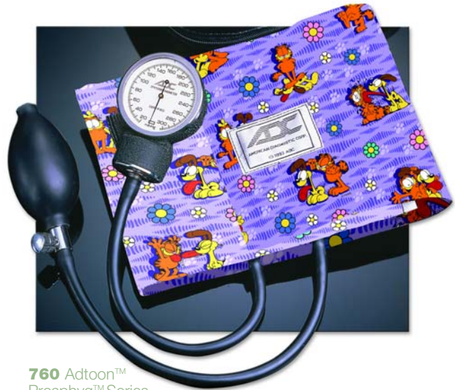
760 Adtoon™ Prophyg™ Series

Same as our Standard 760 Series, except cuff & zippered case are available in pattern matched Adtoon™ fabric prints.