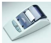
6014P - Optional Advantage™ Thermal Printer

Refer to full catalog for all model options