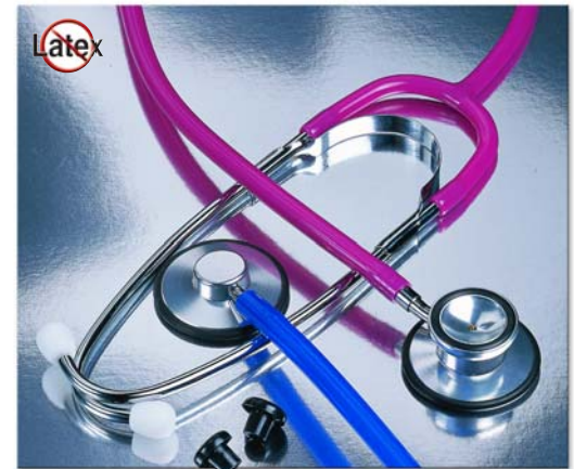
660 / 670 Proscope™ Series