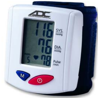
6015 Advantage™ BP