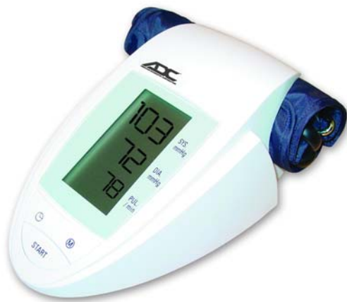
6013 Advantage™ BP