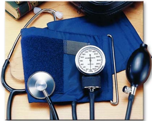
780 Prosplyg™ Series