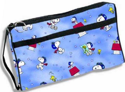
880 Adtoon™ Carry Case (not shown) 888 Adtoon™ Premium Carry Case