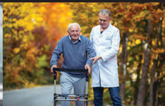
Long-term care facilities