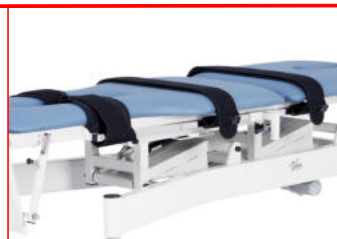
Chest, Waist and Leg Security Straps