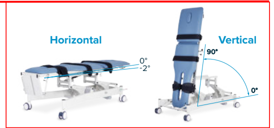
Adjustable Tilt Angle