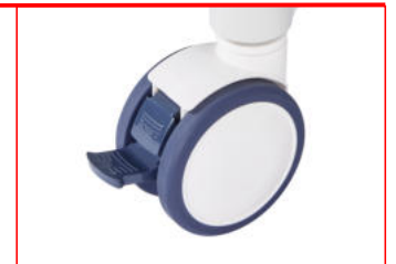
5" Lockable Caster Wheels