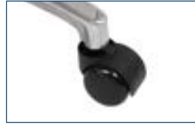
Smooth Gliding Caster Wheels