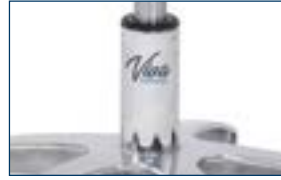
Iron & Aluminum Material