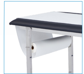
Integrated Paper Roll Holder