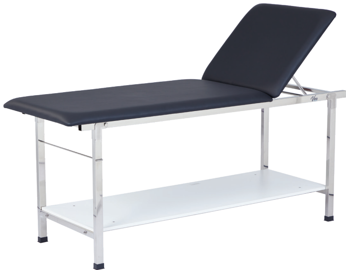
Treatment Table with Shelf and Adjustable Back, Black

Our foldable Treatment Table with Shelf and Adjustable Back is an indispensable asset for any medical facility, engineered to meet the rigorous demands of modern healthcare environments. Its stainless-steel frame offers exceptional durability and easy cleaning, which is ideal for high-traffic medical environments. The adjustable backrest, with multiple recline angles ranging from 0° to 67°, ensures patient comfort during various treatments. When not in use, the foldable leg design and less than 75 lb. body allow for efficient space-saving storage. Our antimicrobial mattress delivers an extra layer of hygiene, which is crucial for maintaining a sterile treatment environment. The integrated paper roll dispenser reassures a sanitary space for your patients. The outfitted shelf will help provide convenience for medical supplies, as well as spare exam paper rolls.