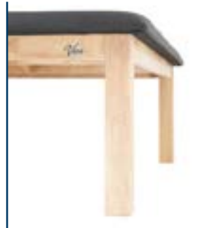
Solid Wood Legs