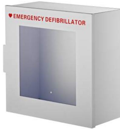
ADI999-01 Non-Alarmed Steel Cabinet for Defibrillators