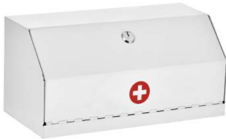
ADI999-05-WHI Locking Drug Cabinet