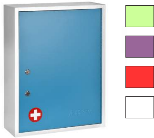
ADI999-04-SERIES Large Medical Security Cabinet, Dual Locks