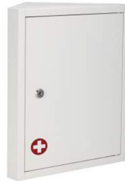
ADIME999-01 Mountable Corner, Two-Shelf Locking Medical Cabinet