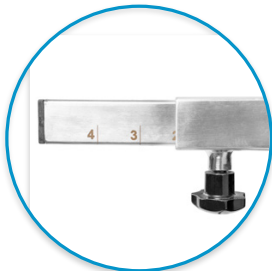
WIDTH- ADJUSTABLE 16.8"-24.7"

ADJUSTABLE HEIGHT AND WIDTH TO SUIT USER PREFERENCES AND EXERCISE REQUIREMENT.