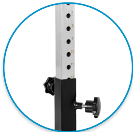
BUILT-IN HEIGHT KNOB 28"-41" HOLE DISTANCE: 1.18"