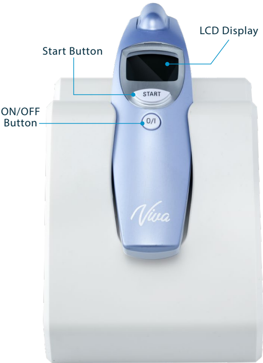
Item #: ADIME914-IT

The included infrared thermometer offers non-contact temperature measurement, reducing the risk of cross-contamination while ensuring patient comfort. Its rapid response sensor delivers highly accurate readings within seconds, enhancing workflow efficiency in busy clinical settings. A backlit digital display provides visibility in various lighting conditions, while a built-in fever alarm alerts healthcare professionals to elevated temperatures. The thermometer's multi-mode functionality allows for both forehead and surface temperature readings, ensuring versatility in diagnostic applications.