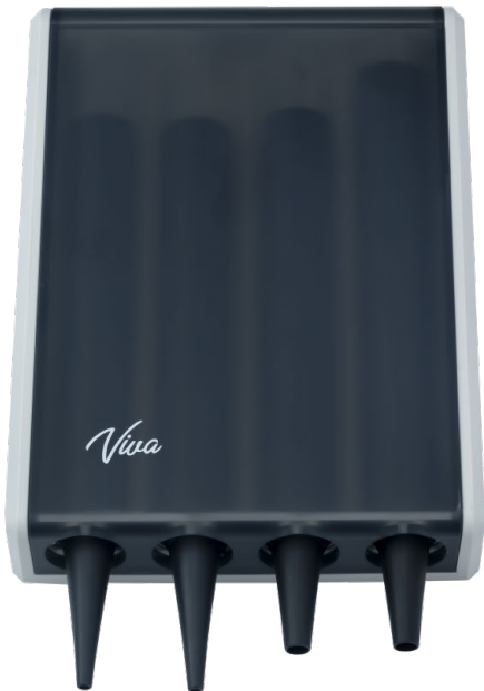
Item #: ADIME914-ESP

An integrated ear specula dispenser facilitates hygienic, single-use dispensing, significantly reducing the risk of cross-contamination. Its frosted, semi-transparent casing allows for effortless inventory monitoring, ensuring quick assessment of supply levels. The top-loading mechanism streamlines refilling, maintaining a steady supply of specula in various sizes.