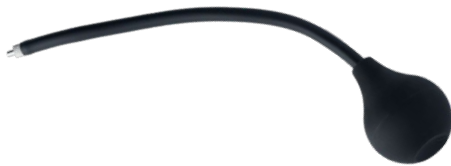
Otoscope - Insufflation Bulb ADIME914-OT-IB

Compatible: Otoscope - Insufflation Bulb