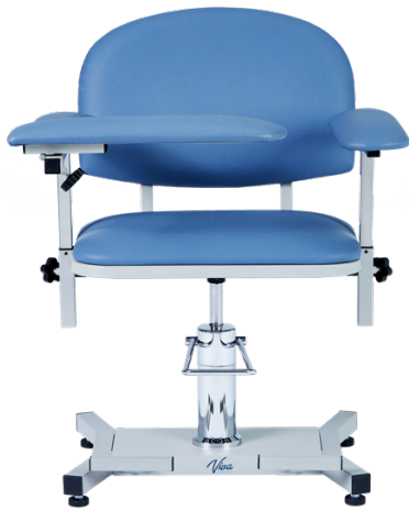
ADIME997-05 Manual Blood Drawing Chair