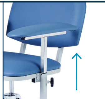
Adjustable Height 8.4"