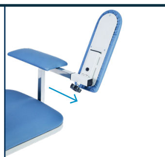
Adjustable Depth 3.15"