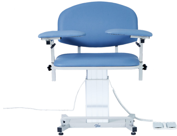
ADIME997-06 Electrical Blood Drawing Chair