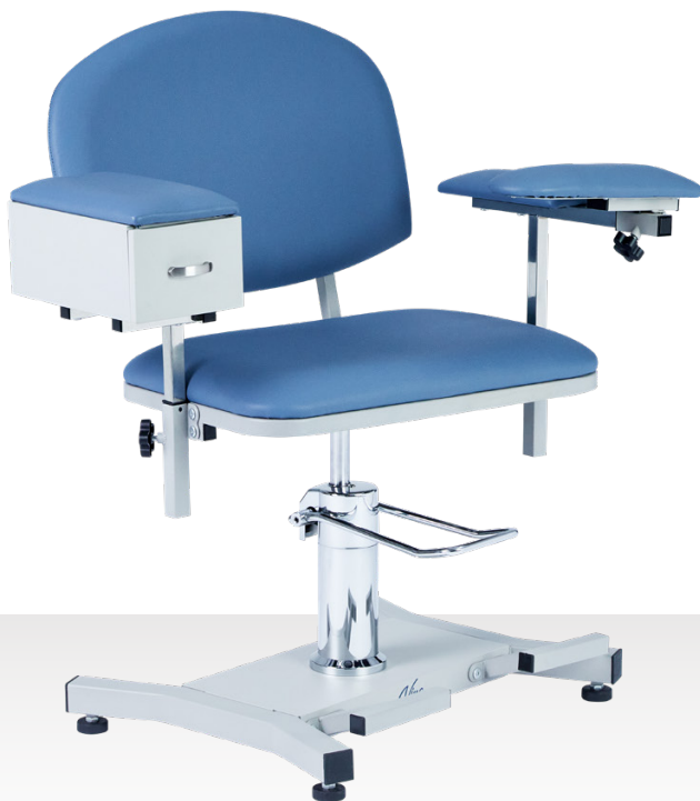
ADIME997-05-DR Manual Blood Drawing Chair with Drawer