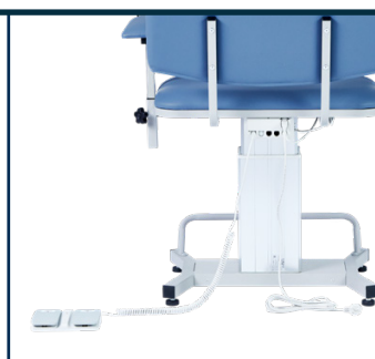
Electric Lift Mechanism and Foot Pedal