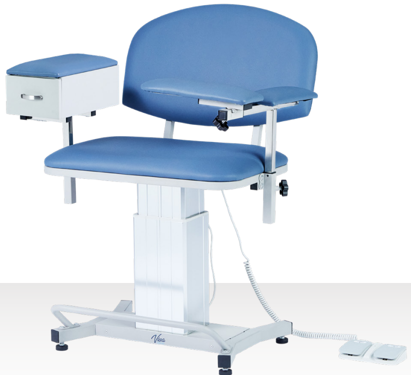
ADIME997-06-DR Electric Blood Drawing Chair with Drawer