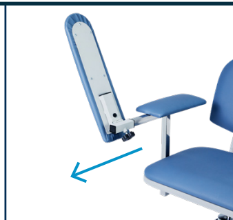
Adjustable Depth 3.15"