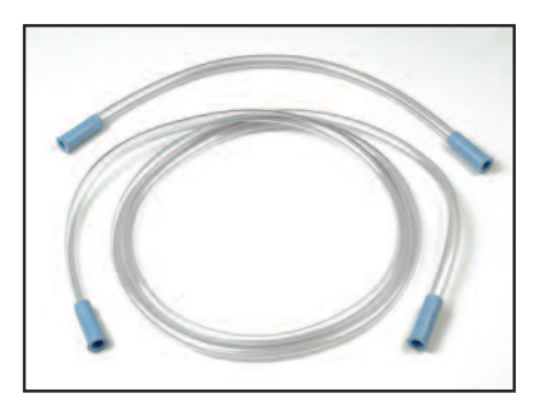
Suction Tubing Kit