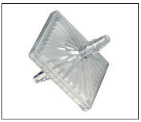
Disposable Hydrophobic/Bacteria Filter