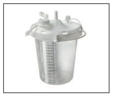
Disposable Collection Canister