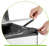
INTERNAL BAG CLIPS