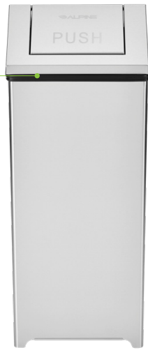
40-Gallon # ALP466-40