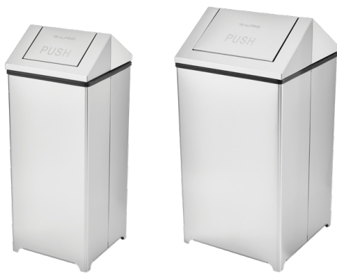
20-Gallon # ALP466-20