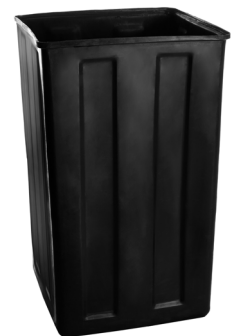
LINER SOLD SEPARATELY