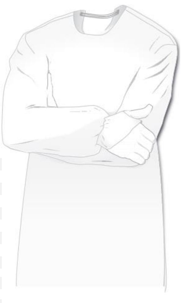
Impervious Coated PP and Chemo tested 10 packs of 10 gowns per case