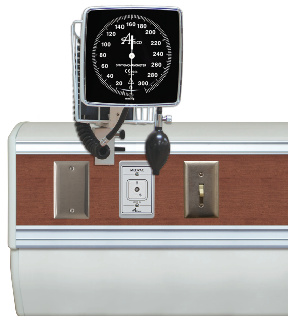
Part Number: AM-AL-LF2118

Amico Diagnostic Incorporated uses precision manufactured components to construct BP Aneroid Sphygmomanometers, providing an accurate reading within 3 mmHg. The clarity of the dial makes it easy to read, and features a scratch and shatter resistant lens. Available with a wide variety of blood pressure cuff and connector configurations.