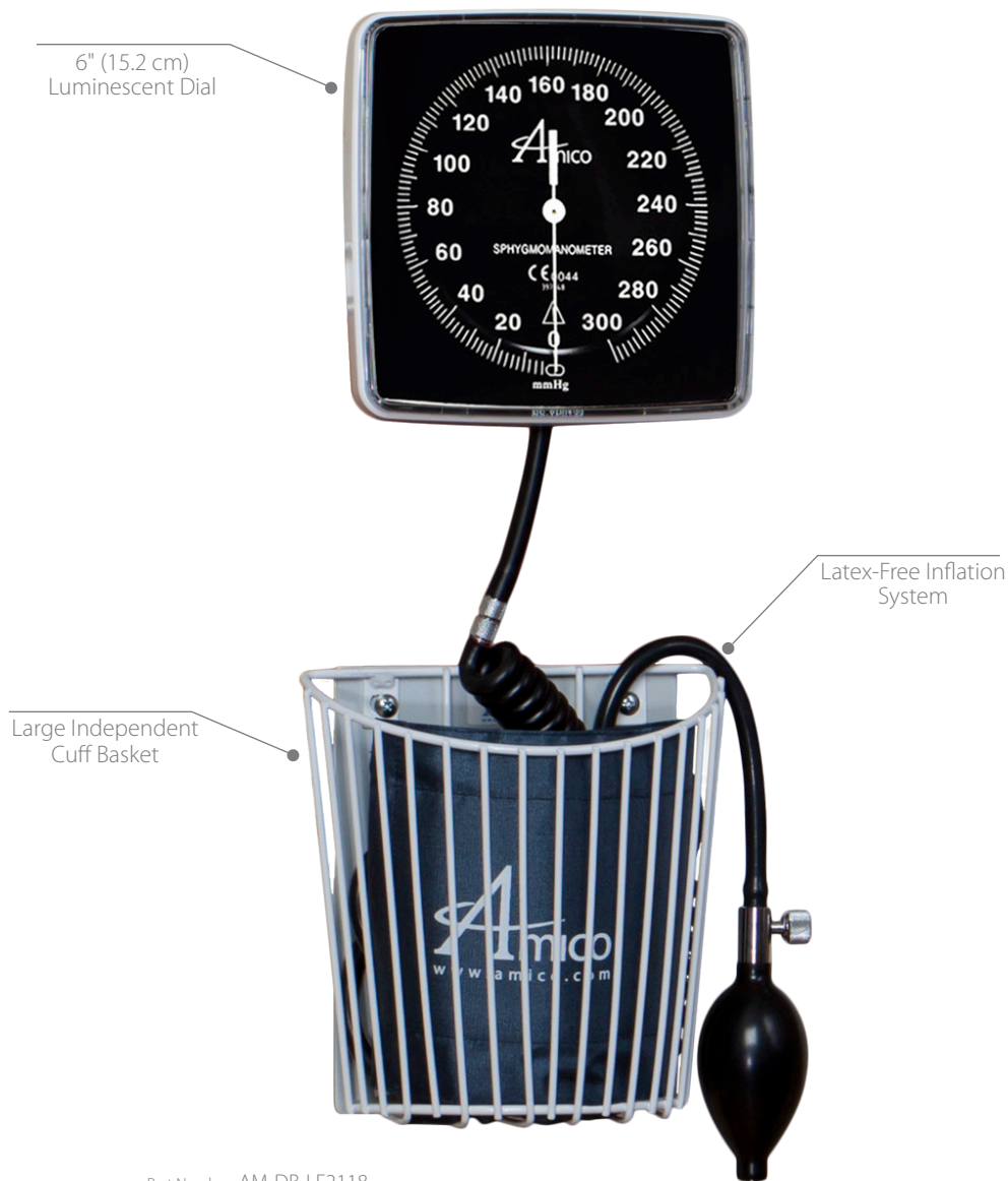
Part Number: AM-DB-LF2118