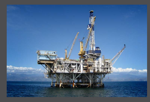
Oil and Gas Brass Valve Dry Chemical, Z-Series, Wheeled

Heavy: Brass Valve Dry Chemical, Z-Series, Class D, Wheeled