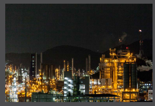
Chemical Brass Valve Dry Chemical, Z-Series, Wheeled

Aluminum Valve Dry Chemical, Clean Agent, K class, Water Mist, CO2, Restaurant Systems