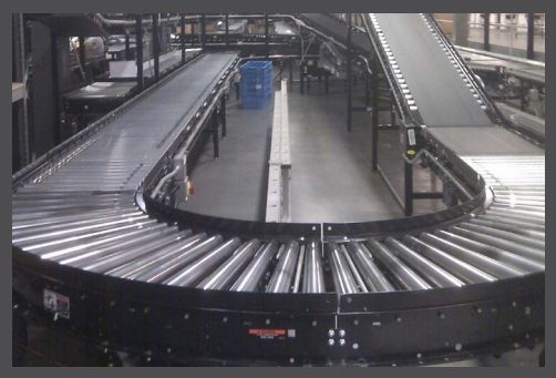
Distribution Centers Brass Valve Dry Chemical, Z-Series, Wheeled