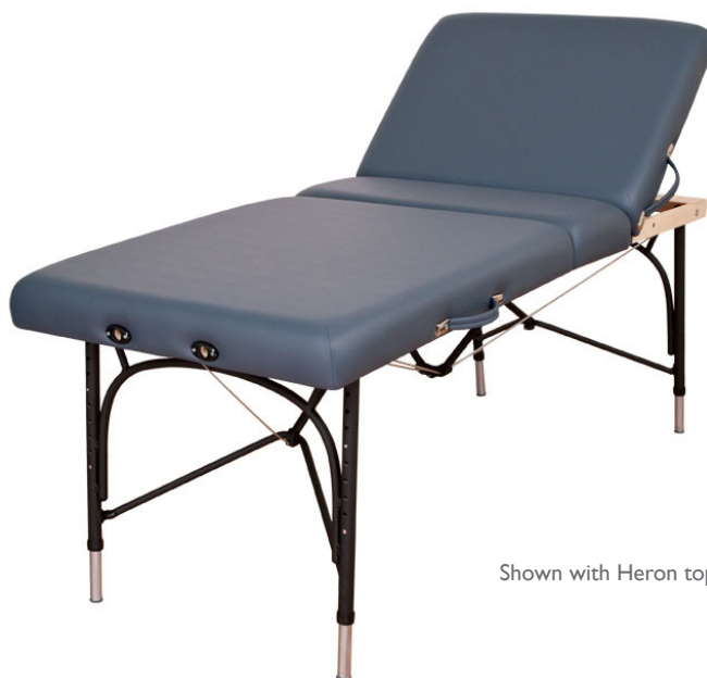
Shown with Heron top