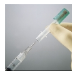
Flip the BD Twinpak and attach the clear BD Blunt Plastic Cannula for split septum IV access.