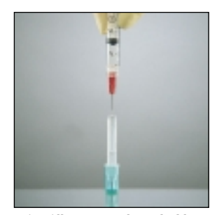
After filling, passively re-shield the Red Hub Cannula.