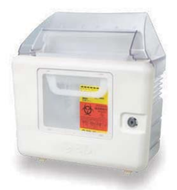
305017 Cabinet with 305551