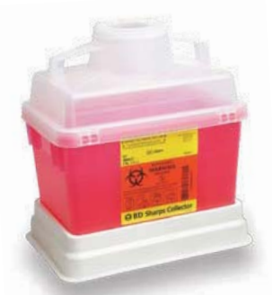
305417 with 305570 Stabilizer