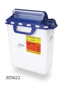
305420 Cabinet with 305622

position without any human intervention.