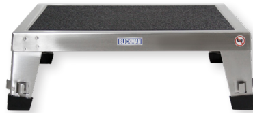
EZ Stool Dimensions: 18 7/8" x 6 1/4" x 13 7/8"

Description: Our EZ stacking stools and dolly are made with our durable stainless steel. The stools are covered with a non-slip rubber tread and feet tips.