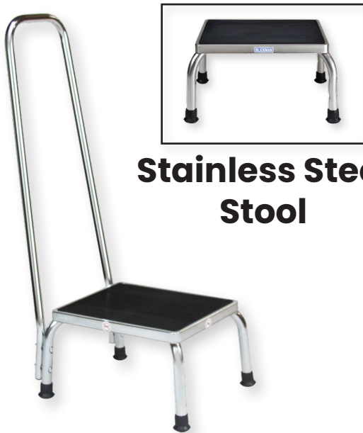
Stainless Steel Stool

Width: 14 1/4" x Height: 9" x Depth: 11 3/8"