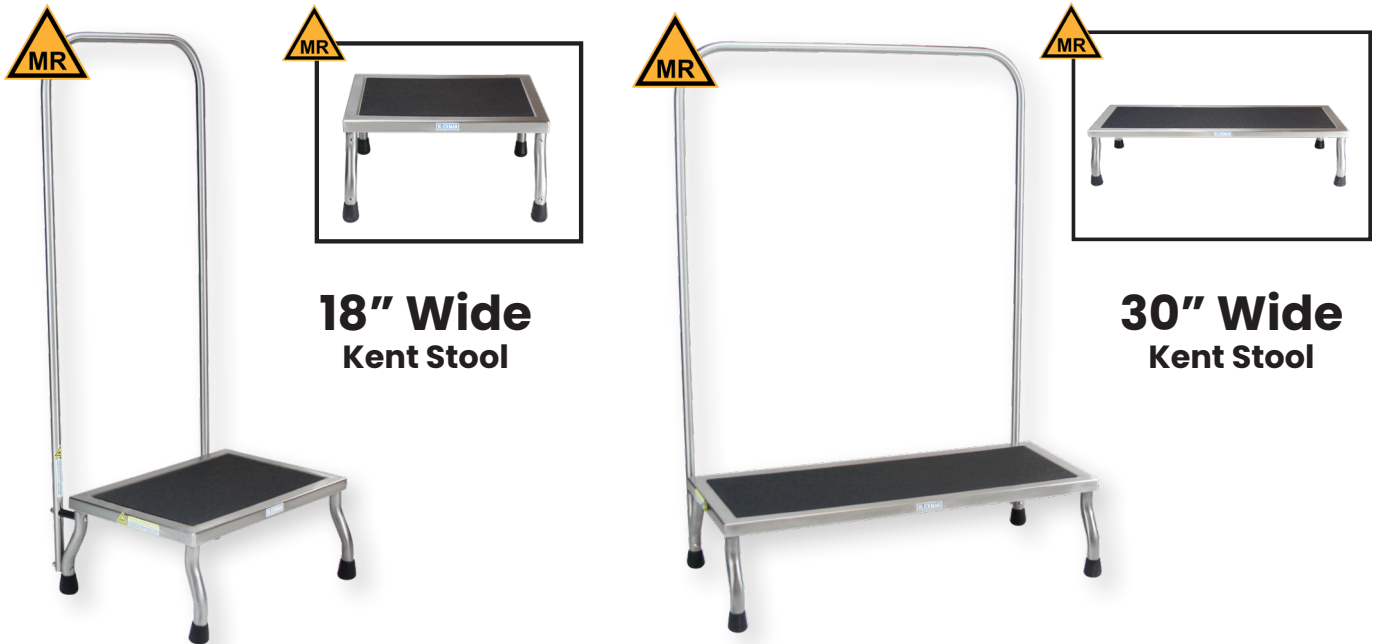
18" Wide Kent Stool

Width: 18" or 30" x Height: 8" x Depth: 12"