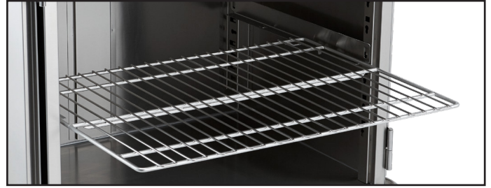
CCC2, 2E, 3, 4, and 5