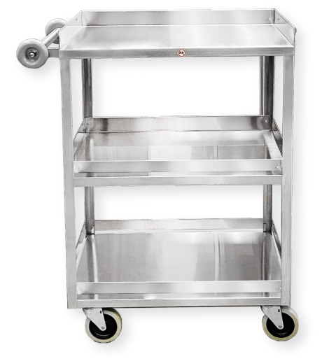
Top Shelf: Three Sided Shelf with Open Front Edge Middle Shelf: Three Sided Shelf with Front Guardrail Bottom Shelf: Shelf with Four Guardrails