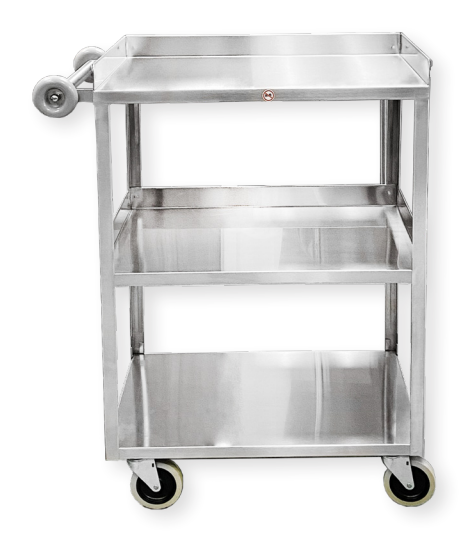
Top Shelf: Three Sided Shelf with Open Front Edge Middle Shelf: Three Sided Shelf with Open Front Edge Bottom Shelf: Open Shelf

Width: 28 1/4" x Height: 35 3/4" x Depth: 16"