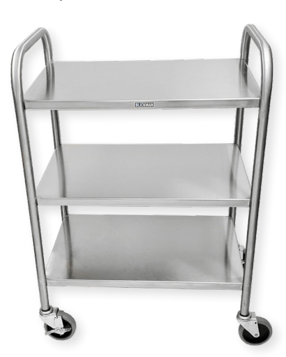
Dimensions: 25" x 16 \frac{1}{2} " x 35 \frac{3}{4} "