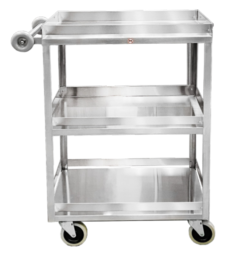
Top Shelf: Three Sided Shelf with Front Guardrail Middle Shelf: Three Sided Shelf with Front Guardrail Bottom Shelf: Shelf with Four Guardrails