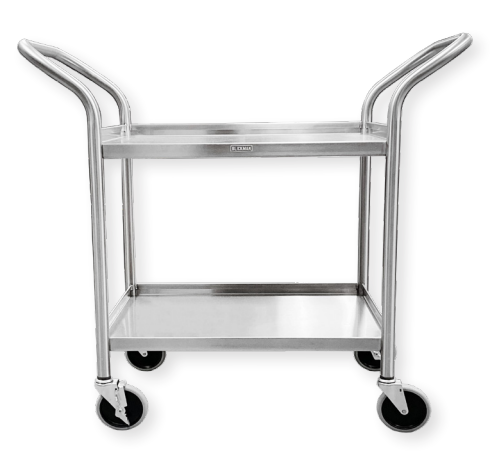
Dimensions: 41 3/4" x 40" x 19 1/4"