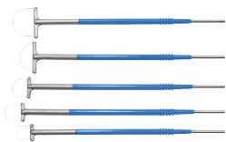
Lletz Loop Electrodes †