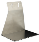
A813 Table Top Stand †