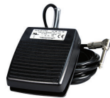
A803 Footswitch †