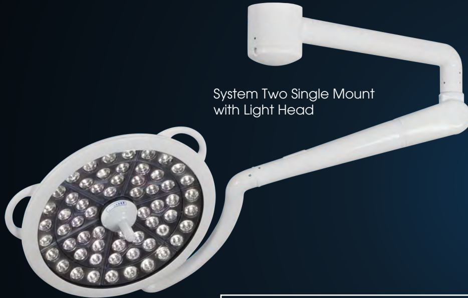
System Two Single Mount with Light Head

The System Two comes in single, dual and triple mounts with one, two or three light or accessory options. Choose the best configuration to fit your operating rooms.