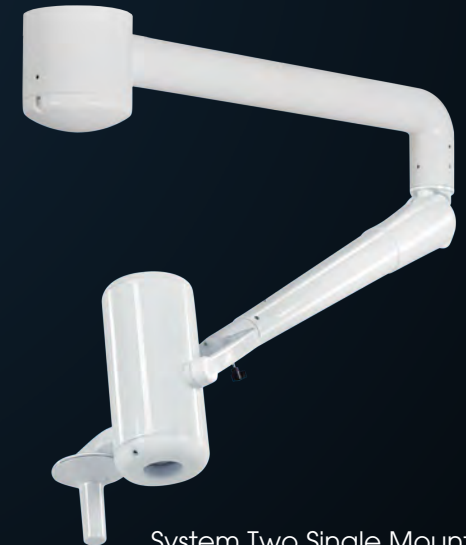
System Two Single Mount with HD Video Camera

The single-light mounting system offers unsurpassed flexibility, exceptional illumination, and outstanding shadow control – even with just a single light head. This mounting can also support the high-definition video camera or monitor arm.