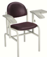
Model 1500 in Cabernet

Seat alignment positions patients securely on the chair, while innovative angled armrests and easy-to-use knob height adjustments provide optimal arm position for each patient's blood draw. Features include two standard add-on work surfaces (to accommodate prep materials, paperwork and vials). Chair also meets BIFMA Standards. An optional drawer (Model #101059) can be attached on either side of chair to keep prep materials nearby yet out of sight.