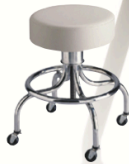
Model 23051 in Arctic

This economical exam stool is made to stand the test of time. The Tradition Series features spinlift height adjustment from 19.5"-27.5" (49.5 cm-69.9 cm), a sturdy four-leg chrome base, 14" (35.6 cm) wide, 3.5" (8.9 cm) thick poly-foam seat cushion and 2" (5.1 cm) rubber wheel, ball bearing casters.