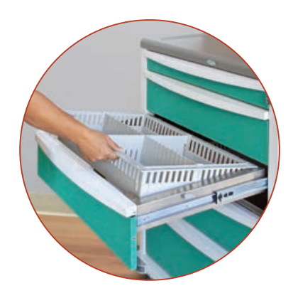
I-Series carts can accommodate a variety of ISO trays and baskets.

The maximum flexibility of the I-Series platform is evidenced by a wide array of cart models that