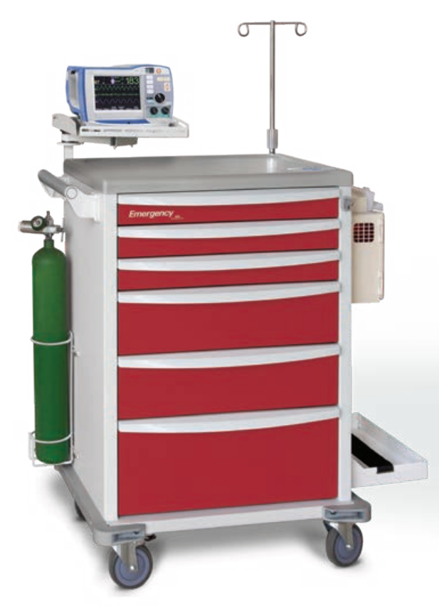
I-Series Emergency Cart with accessories

All I-Series carts are constructed of lightweight aluminum panels, sturdy internal frame, and premium drawer slides to ensure long-term value and durability.