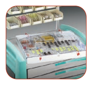
Divided Drawer Tray