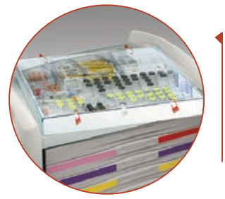
Removable drawer trays promote orderly storage and organization of emergency supplies

Contents are secured with a breakaway locking handle, yet a simple and swift motion can quickly break the tamper-evident seal giving access to all drawers and emergency supplies.