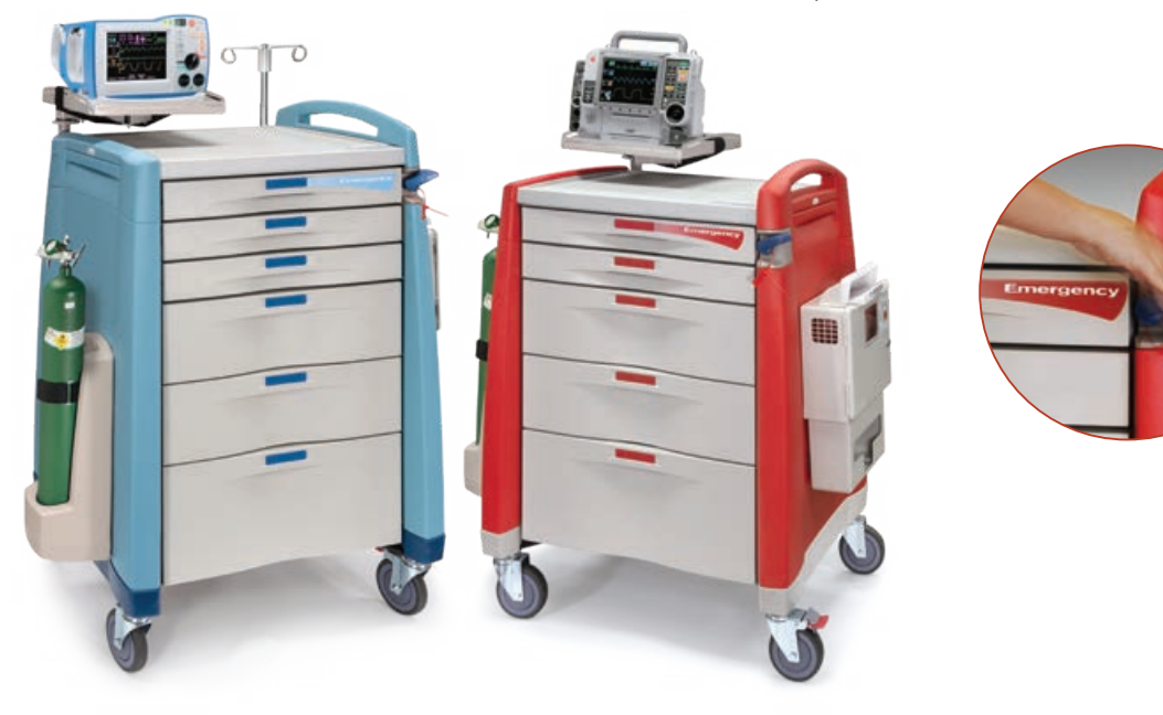
Quick-Access lock offers the security you require and ensures quick access to code cart supplies

The unique breakaway locking handle offers optimal security and the simple access essential to every emergency response. Stable maneuverability is built-in to every cart and a full line of accessories enhance user efficiency and support code team performance.