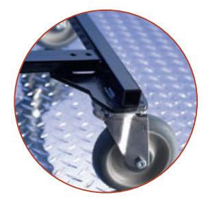
Precision welded all-steel frame is virtually indestructible

Select from an array of drawer divider and tray solutions that offer complete flexibility for organizing supplies in each drawer.