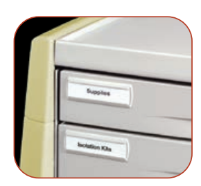
Drawer Tag Holder