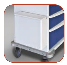
Waste Container w/ Lid