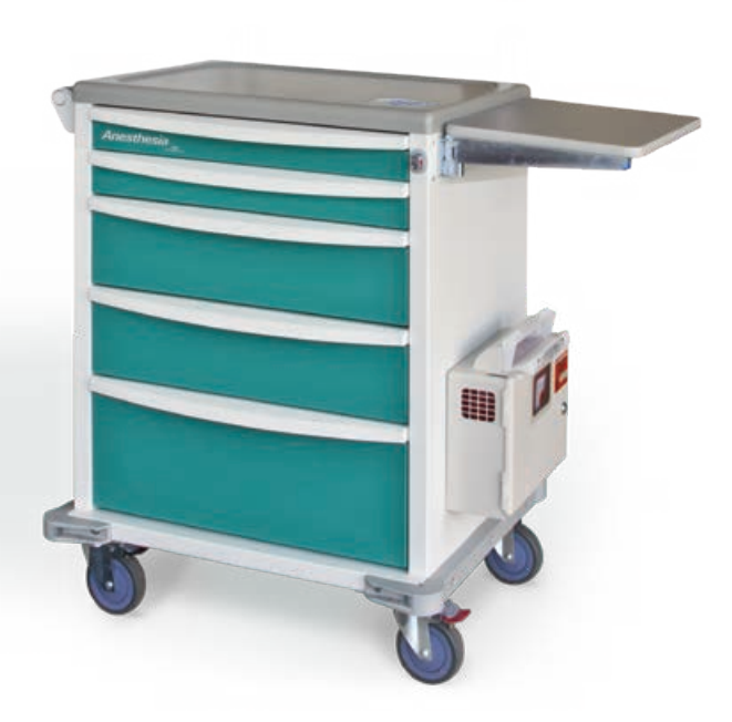
I-Series Anesthesia Cart with accessories