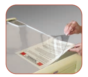
Clear Top Mat