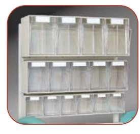
Tilt Bin Organizers