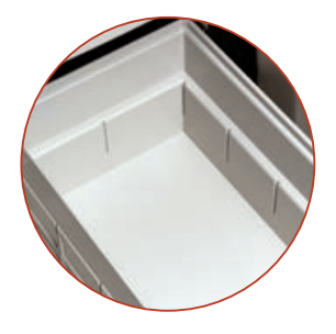
Seamless Drawer Trays are durable and prevent issues associated with pop rivets or sharp edges found in metal drawers

The Avalo Series Procedure Cart offers a wide selection of organization accessories, large capacity, and a choice of models in 4-drawer, 5-drawer, or custom configurations. The Avalo Procedure Cart is adaptable to many different healthcare applications including trauma, airway, dressing, cast, or general supply cart. Ensure security with a choice of three (3) proven lock systems including an advanced keyless entry with auto-relock.