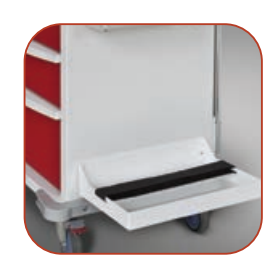
Suction Pump Shelf