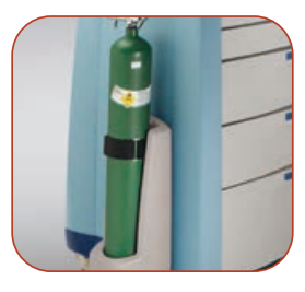
Oxygen Tank Holder