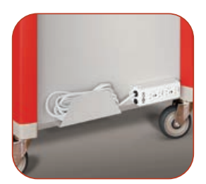
Plug Outlet Strip UL1363A Rated