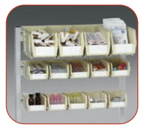
Bulk Storage Bins