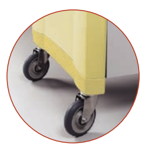
Spread Caster Position provides stability control by moving the wheels out toward the corners of the cart frame