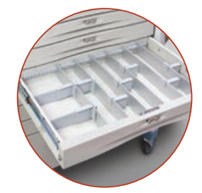
Drawer Flex Dividers