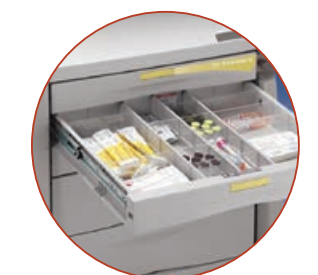
Integral Drawer Dividers offer the flexibility to organize and re-arrange drawer contents

A sturdy work surface offers ample room to efficiently prepare I.V. solutions. Expand your work area with a sizable slide-out work surface, positionable on either the right or left side of the cart.