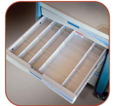
3" Drawer Dividers (Set of 2)