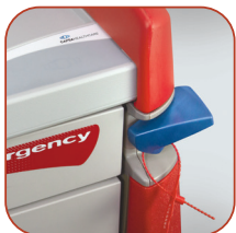
Tamper Evident Seals (100)