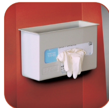
Single Glove Box