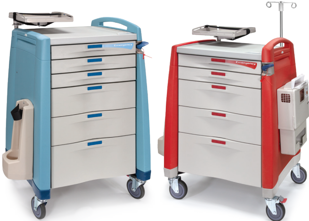
Blue Emergency Cart Standard Height Shown with Accessory Package 2 Red Emergency Cart Intermediate Height Shown with Accessory Package 3

The Avalo Emergency Cart is available in blue or red in three different heights. Choose a base cart in Standard, Intermediate or Compact height, then add a convenient accessory package to meet the workflow and storage requirements for your facility.