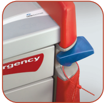
Tamper Evident Seals (100)