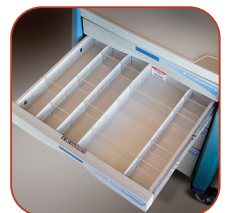
3" Drawer Dividers (Set of 2)