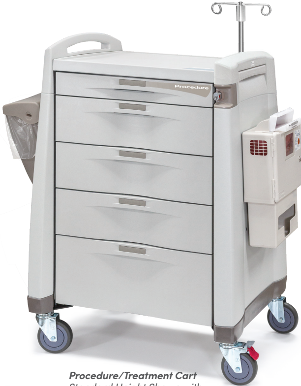
Procedure/Treatment Cart Standard Height Shown with Accessory Package 2

The cart is adaptable to many different healthcare applications, including trauma, airway, dressing, cast, or general supply cart. A selection of proven lock systems provides secure and safe storage.