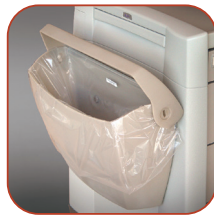
Waste with Lid