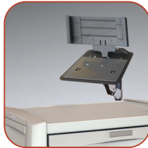
Laptop Security Tray