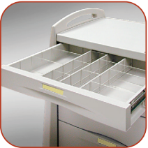
3" Drawer Divider (1)