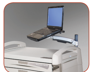
Laptop Arm & Tray