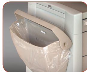
Waste with Lid*