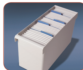
Punch Card Tub