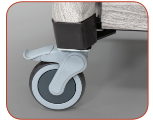
5" Brake Caster*