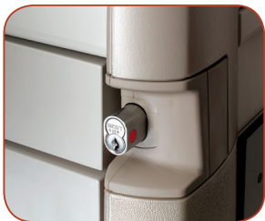
Core Removable Lock*

For additional accessories see CapsaHealthcare.com