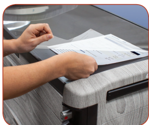
Clear Top Mat